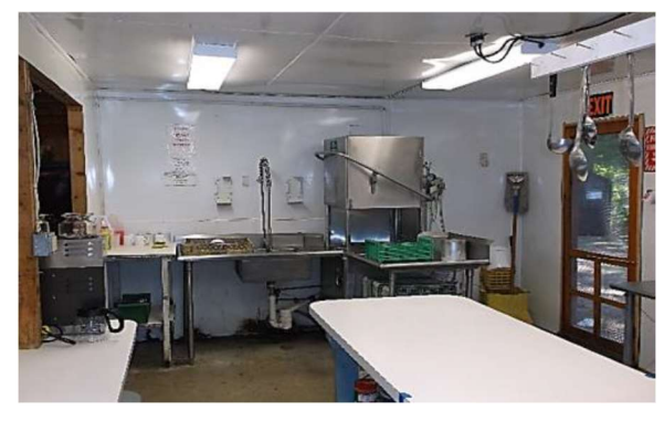
Gas Stove, Dishwasher, Walk-in Cooler and Prep Areas