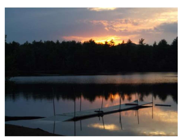
THEN LOOK NO FURTHER THAN CAMP NEOFA.